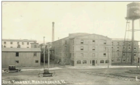
The Tannery contributed to Johnston Run pollution until the 1980's. The area has been in remediation since then.