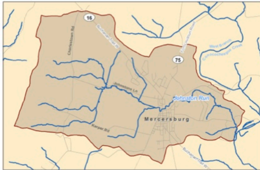
Map of Johnston Run Watershed

Gathering water from the Tuscarora foot hills and surrounding farmland, Johnston Run creates the border between Peters and Montgomery. It flows past the ball park and the VFW, through Mercersburg Borough and on to the West Conococheague, that joins the Potomac River at Williamsport, Maryland and, ultimately, the Chesapeake Bay at Point Lookout.