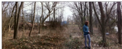
Imagine new walkways along clean waterways!