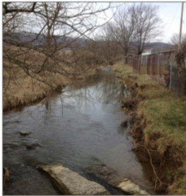
Erosion can be seen along various parts of the waterway.