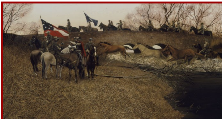
Charting the Course at Bridgeside

(Depart no later than 3 PM for Evening Reception @ Wilson College—7 PM)